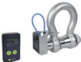
Wireless load shackle