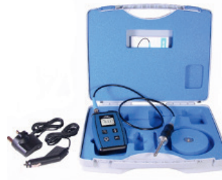
Portable vibration measurement kit