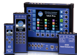
Vibration data collection