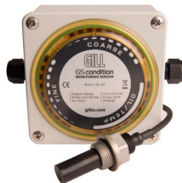
Oil debris monitoring