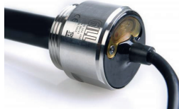
USB prog. Level sensor