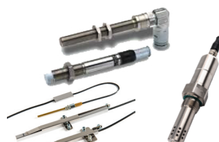
Sensors for optimization and monitoring