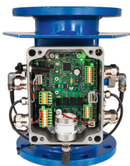
Oil Mist Detectors