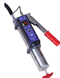
Lubrication control with data collection