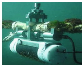
Datalogger dynamic line