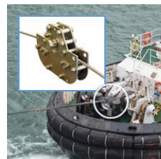
Running line tensiometer on tug