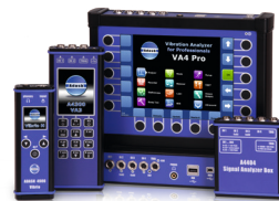
Vibration monitoring devices