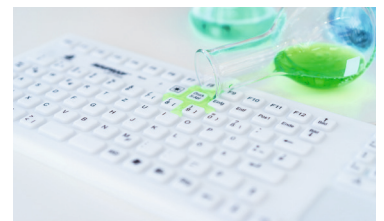
Chemical resistant +IP 68 keyboards