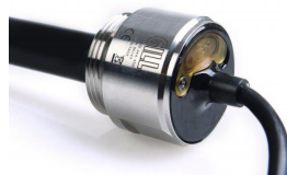
Blackwater Level sensor