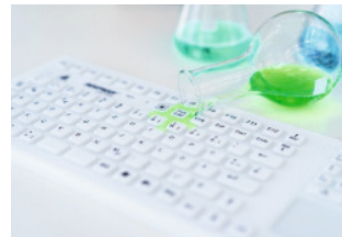
Keyboards IP68 , capasative , clinical , resistant against chemicals.