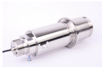
Customized force products