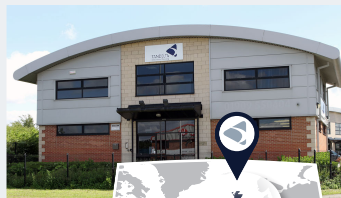
Tan Delta Head Office 1 CARRERA COURT SHEFFIELD UK

All Tan Delta products are engineered and quality manufactured for long term continuous operation in the harshest commercial and industrial environments. Each product is carefully engineered and tested to withstand the long term effects of extreme shock, vibration, heat, cold, thermal shock, electrical interference and many more factors.