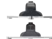
Front & Back View