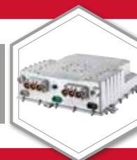
Power Electronics WTI D260