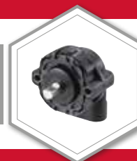
Rotary Sensors WM-H10