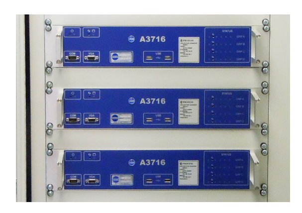
Example of use - 3 pieces of A3716 2U

The A3716 module contains 16 AC, 16 DC and 4 TACHO inputs. All channels are measured simultaneously. The A3716 modules can be easily combined to create a system with more channels.